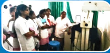
Hand's on training