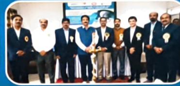
National Level Conference on Artificial intelligence Sponsored by SERB