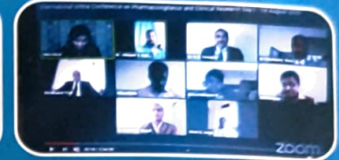
International Online Conference on Pharmacovigilance and Clinical Research