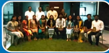
Felicitation of GPAT Qualified students