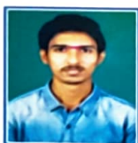
Lalitkumar Vhatkar Encube Ethicals Pvt.Ltd. 3.50 LPA