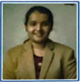
Pranali Sakate Municipal Corporation 3.5 LPA