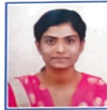
Shamal Mali Episource 4.11 LPA